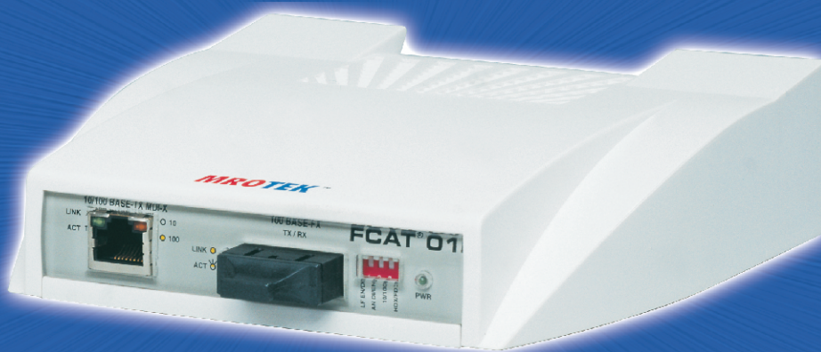
FCAT ® 01

The FCAT ® 01 series of Fast Ethernet Media converters provides media conversion from 10/100BASE-T to 100BASE-FX on multimode or single mode fiber ranging from 2km to 100kms. Available in Managed, Unmanaged, Stand Alone/Rack, AC/DC Power supplies & a versatile range of Fiber Optic interfaces FCAT ® 01 series becomes a complete offering to suit Carriers, Service Providers & Enterprises for wide range of deployments.